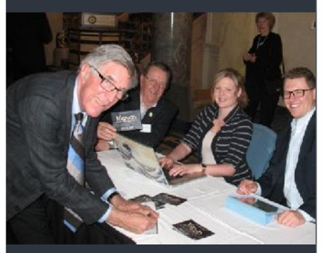
The rush to buy gala tickets

transit authority did not have a long-term strategic plan. City council, working with Calgary Transit, has remedied this, leading to the creation of a $1 billion capital plan to improve our transit system. We are buying new C-Train cars to replace the aging U2 units, and to operate four car trains. Transit stations are being made safer, and their platforms being lengthened to accommodate the four car trains. Finally, GPS equipment is being installed on all buses, so that transit riders will soon have real time bus arrival information.